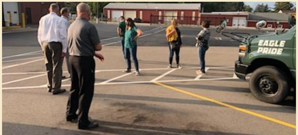
Middle: BOE members take a look at the cross- walk and other pavement markings for increased safety.