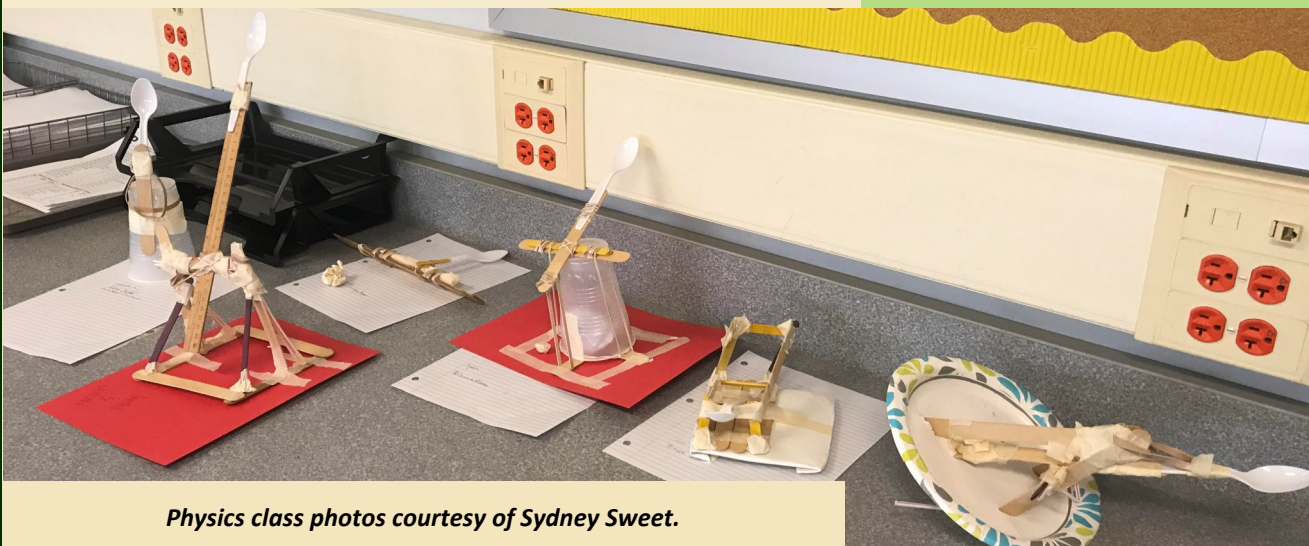
Physics class photos courtesy of Sydney Sweet.