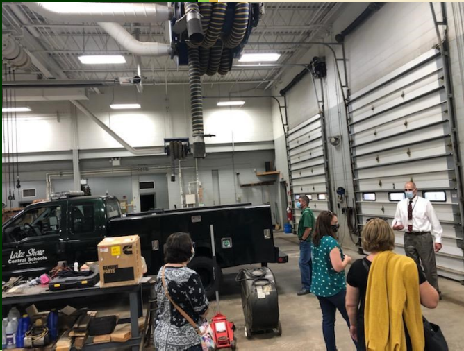
Above left: BOE members tour the bus garage.

From Transportation Department Report at Sept. 7, 2021 BOE Meeting